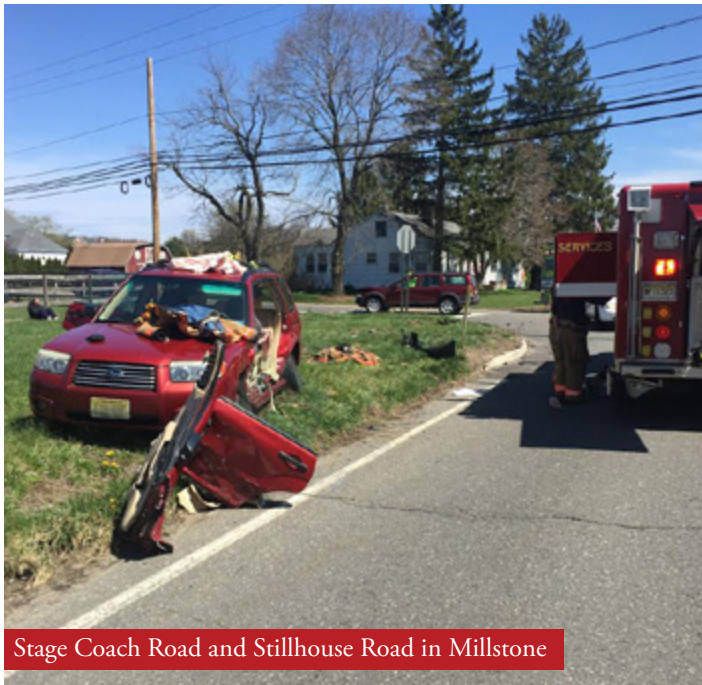
Stage Coach Road and Stillhouse Road in Millstone