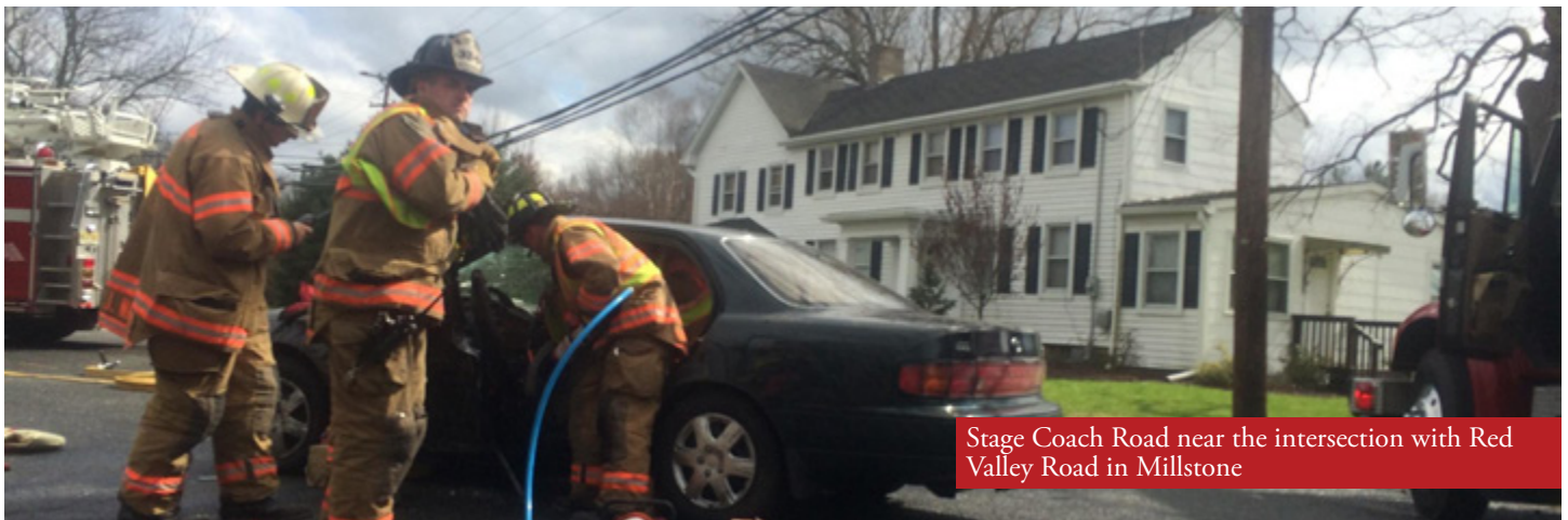
Stage Coach Road near the intersection with Red Valley Road in Millstone

Registered voters may apply to vote by mail for any reason. Applications can be picked up at the County Clerk's office or found at www.monmouthcountylvotes.com . Applications must be received by mail one week prior to the election. Voters may also apply in person at the County Clerk's office up until 3 p.m. the day before the election.